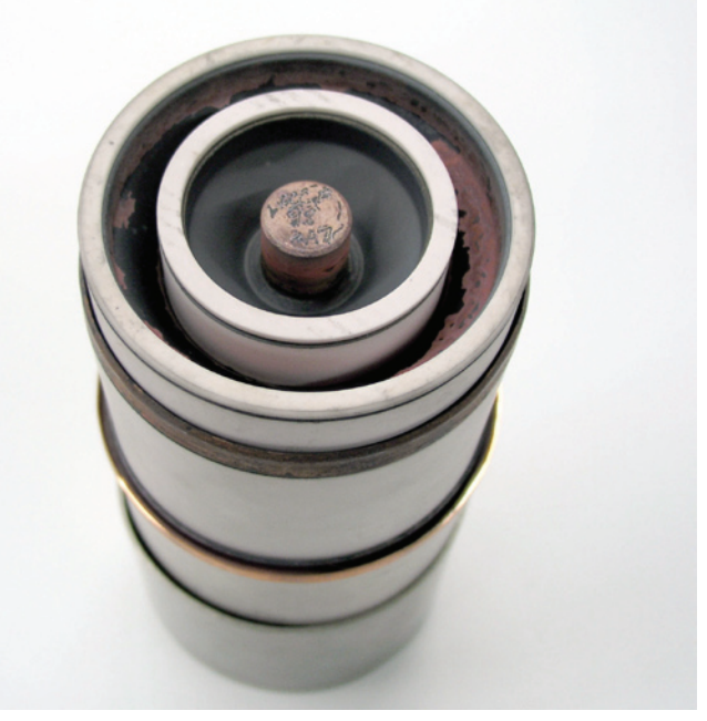
Figure 4 Tube with evidence of overheating. Note the severe discoloration in the tube stem. This tube will have a very short lifetime.