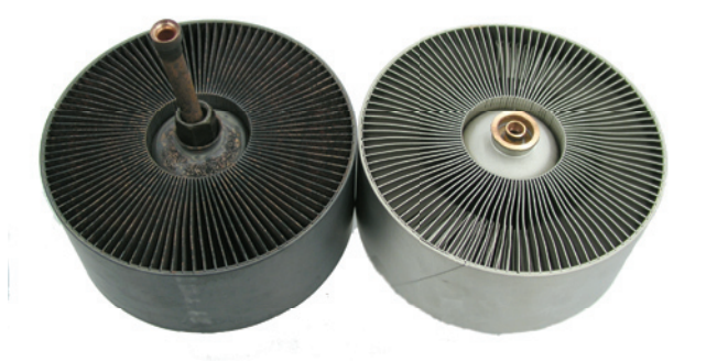
Figure 2 Improper cooling means short life. Discoloration of metal around the anode fins (left) indicates poor cooling or improper operation of the tube. A properly cooled and operated tube (right) shows no discoloration after many hours of use. Note: these pictured anodes were part of a collection being prepared for remanufacture.

For a better understanding of this sensitive aging mechanism, the filament itself must be understood. Most filaments in high-power, gridded tubes are a mixture of tungsten and thoria with a chemical composition of W + THO_2 . Filaments made of this wire are not suitable electron emitters for extended life applications until they are processed. Once the filament is formed into the desired shape and mounted, it is heated to approximately 2100°C in the presence of a hydrocarbon. The resulting thermochemical reaction forms di-tungsten carbide on