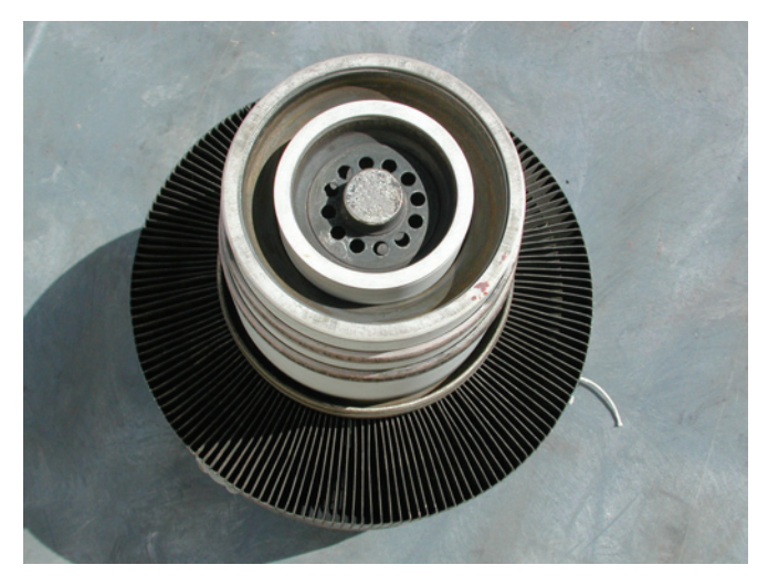
Figure 6 This tube appears to have been in a socket for only a short time, but already has evidence of overheating. Note the discolored stem and anode fins. This tube will have a short lifetime.