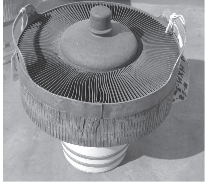
Figure 3 Example of a severely overheated tube. The cooling fins are discolored and badly distorted. This type of overheating will cause premature tube failure.