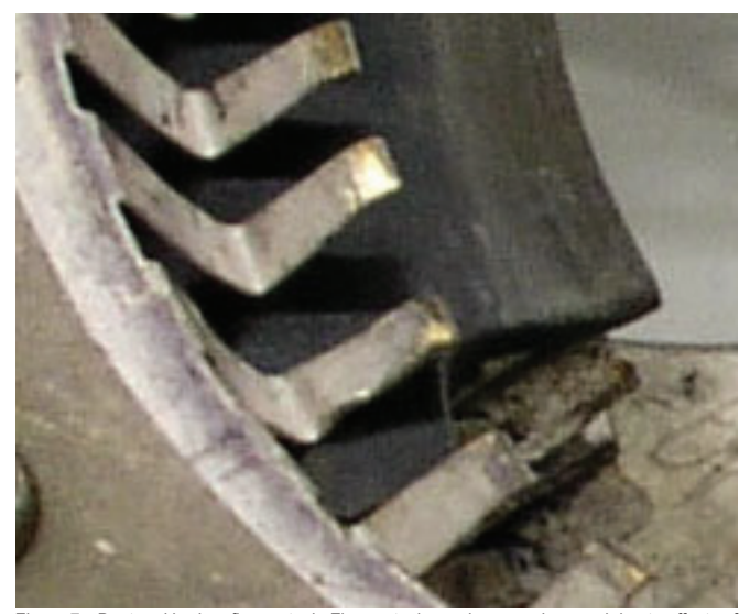
Figure 7 Bent and broken finger stock. Finger stock may become damaged due to effects of overheating or mishandling. Any broken finger stock must be repaired or replaced immediately to ensure long tube life.

the filament's surface. Life is proportional to the degree of carburization from this process. If the filament is overcarburized, however, it will be brittle and easily broken during handling and transporting. Therefore, only approximately 25% of the cross-sectional area of the wire is converted to di-tungsten carbide. Di-tungsten carbide has a higher resistance than tungsten; thus, the reaction can be carefully monitored by observing the reduction in filament current as the carburizing process proceeds.