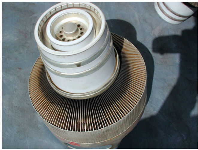
Figure 5 This tube shows evidence of being well mounted in a socket for at least a year (note the marks on the contact ring from the finger stock). However, there is no discoloration of the stem and the anode fins have very little discoloration. This tube will last for a good period of time because it is being run under favorable conditions.