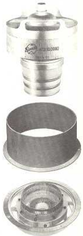
SK-1306 Chimney shown with 4CX10,000 and SK-300 socket